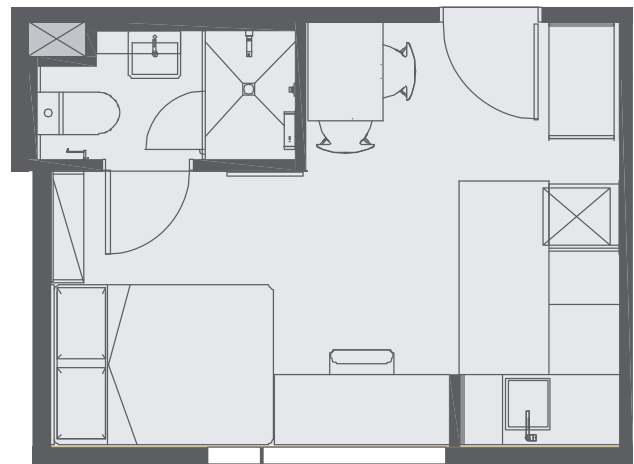
FLOOR PLAN B › STANDARD STUDIOS ONLY

Standard and Premium studios are available.