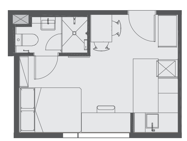
FLOOR PLAN B > STANDARD STUDIOS ONLY