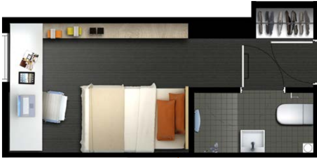
TYPICAL BEDROOM LAYOUT