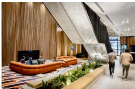
IGLU SOUTH YARRA [MELBOURNE] 5 / 6 bedroom (en-suite) share apartment

RENTAL ASSISTANCE OF $6,708 COMPARED TO 2020 RACK RATES