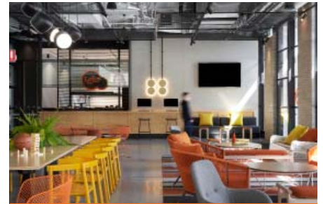
IGLU MELBOURNE CITY [MELBOURNE] 6 bedroom (en-suite) share apartment

RENTAL ASSISTANCE OF $3,900 COMPARED TO 2020 RACK RATES