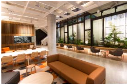
IGLU BRISBANE CITY [BRISBANE] 6 bedroom (3 bathroom) share apartment

Students applying for one of the room types listed below will be eligible to apply for an Iglu Regional Scholarship and receive annual rental assistance of up to $8,000* .