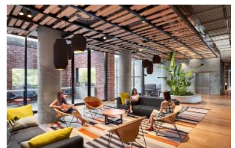
IGLU REDFERN [SYDNEY] 6 bedroom (en-suite) share apartment

RENTAL ASSISTANCE OF $5,668 COMPARED TO 2020 RACK RATES