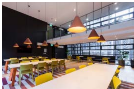
IGLU BROADWAY [SYDNEY] 5 / 6 bedroom (en-suite) share apartment

RENTAL ASSISTANCE OF $4,160* COMPARED TO 2020 RACK RATES