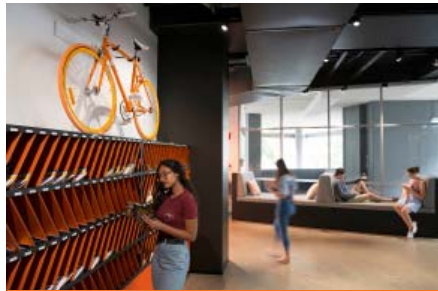
IGLU KELVIN GROVE [BRISBANE] 5 bedroom (2 bathroom) share apartment

RENTAL ASSISTANCE OF $3,640 COMPARED TO 2020 RACK RATES