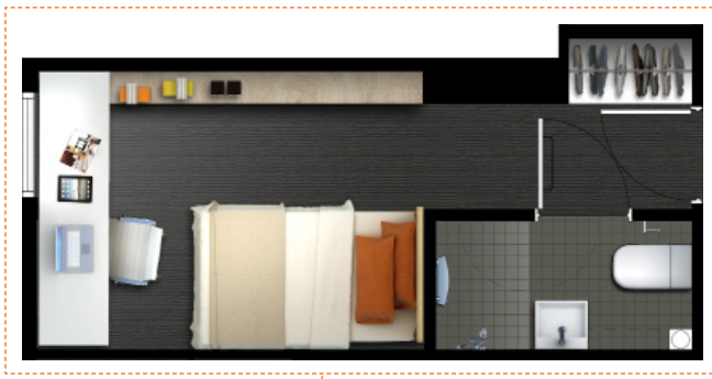
TYPICAL BEDROOM LAYOUT