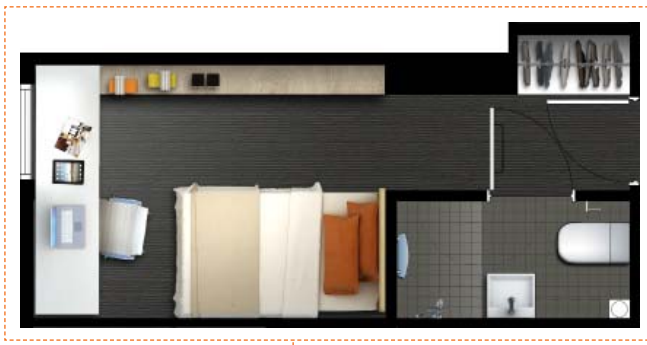
TYPICAL BEDROOM LAYOUT